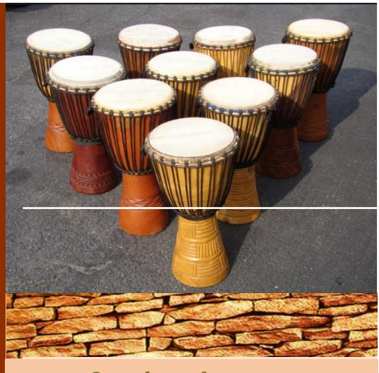
Sunday, August 12

7:00 p.m. – 11:00 p.m. Dance (Social Event). YouthChildren and Adults